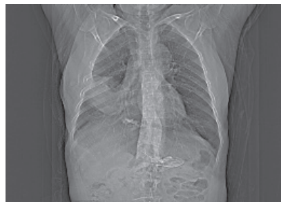
图 1 右侧胸腔积液